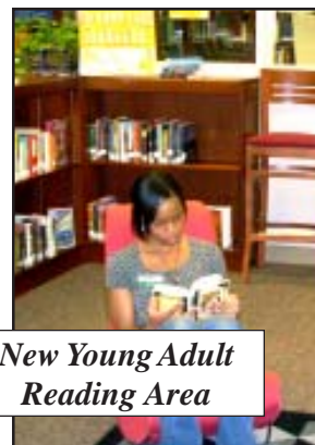
New Young Adult Reading Area

FRIENDS —thanks to your hard work, volunteer efforts, and fund-raising during the year, our Winder library is able to offer programs and activities for children and adults.