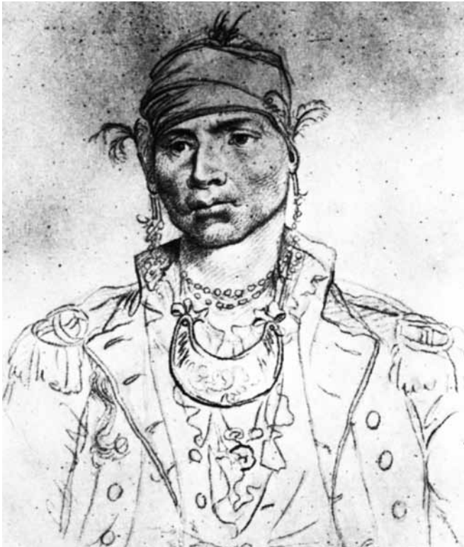
Alexander McGillivray or Tallassee Mico? by John Trumbull, 1790

McGillivray died in Florida, February 13, 1793.