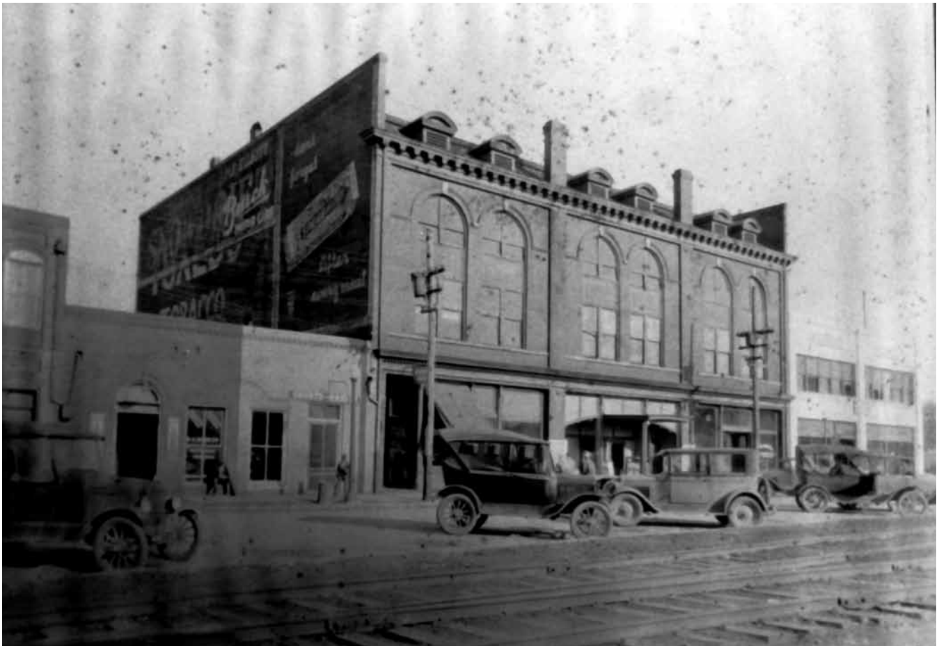
The Opera House, built circa 1907, Harmony Grove