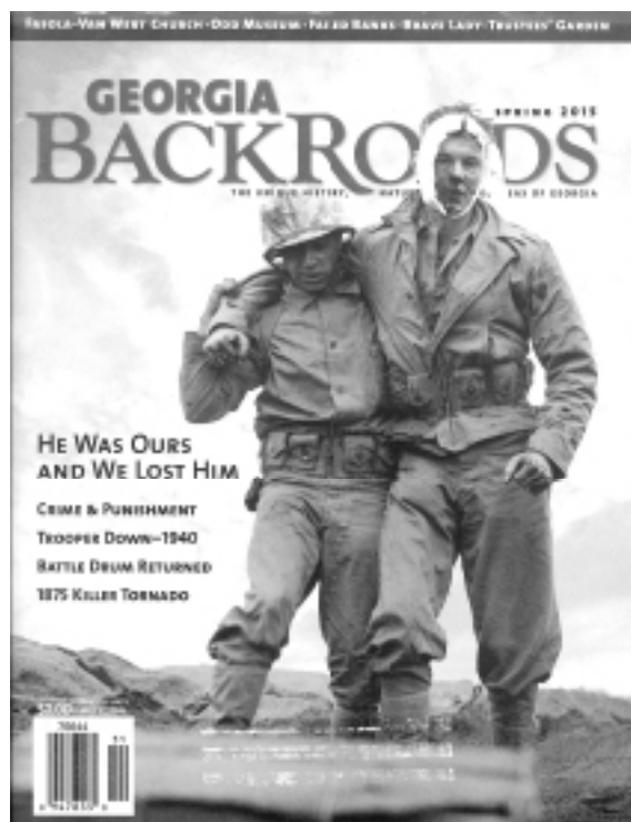
Issues of "Georgia Backroads" Magazine