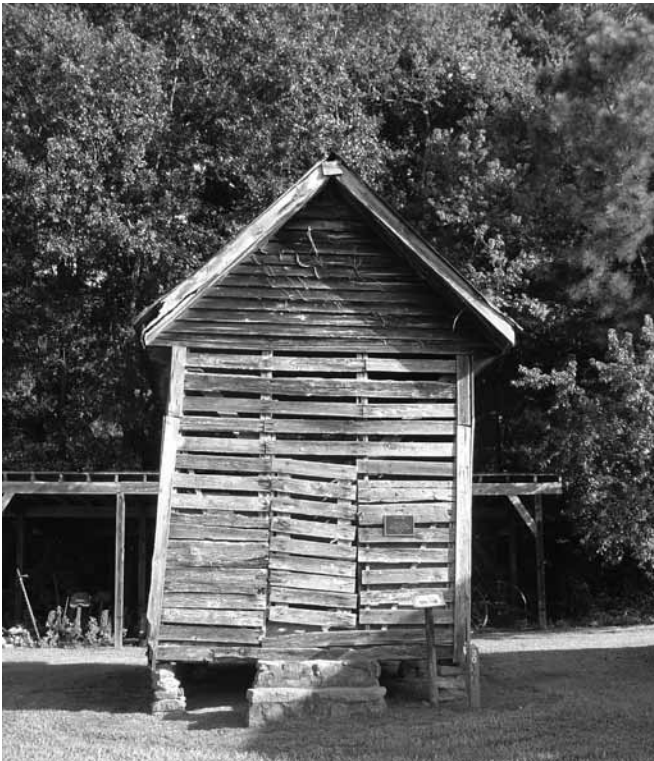
Corn Crib circa 1900 was located in Apple Valley on the Morgan Nix Farm.