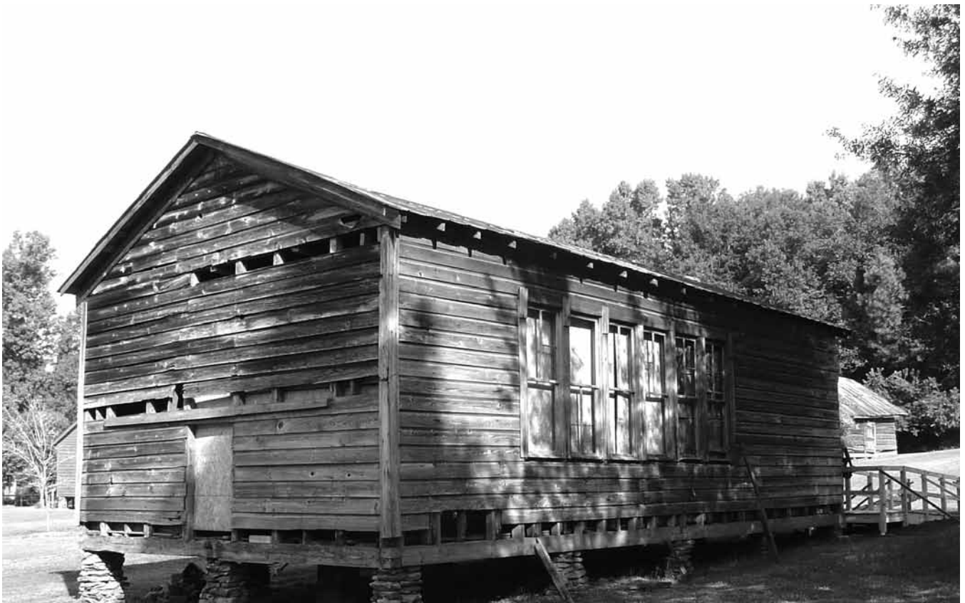
Crossroads School House was an African American school located in Nicholson, as early as 1881.