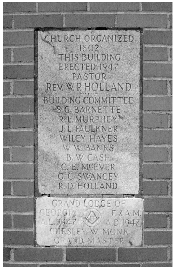
Photograph of the corner stone at Walnut Fork Church

Captain DeLaperriere is one of the hardest and most faithful players on the team. He knows the game in detail, is popular with the boys, has a good football head and will handle the team all right.