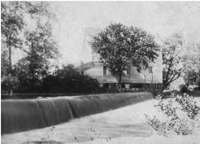
Hoods Mill in Apple Valley