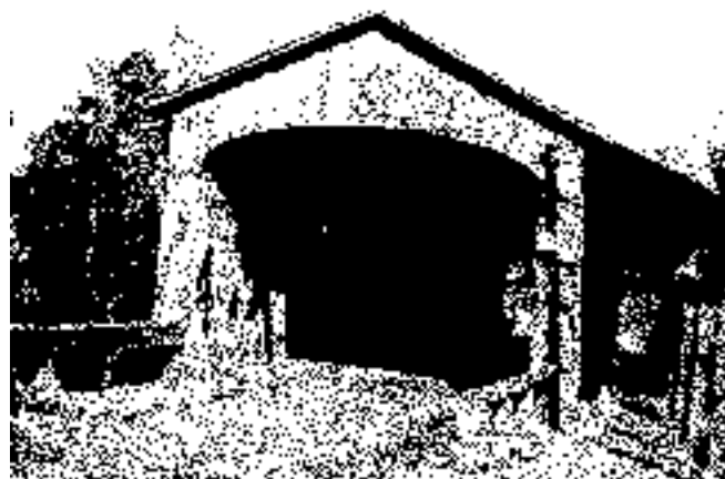
photo above: Wooden covered bridge built in 1900 across Curry Creek in Jefferson

The Curry Creek bridge is a local landmark in Jefferson. Built in 1925 to replace a wooden covered bridge, it incorporated the latest engineering technology in its solid concrete arch design. Originally it had cast iron street lamps.