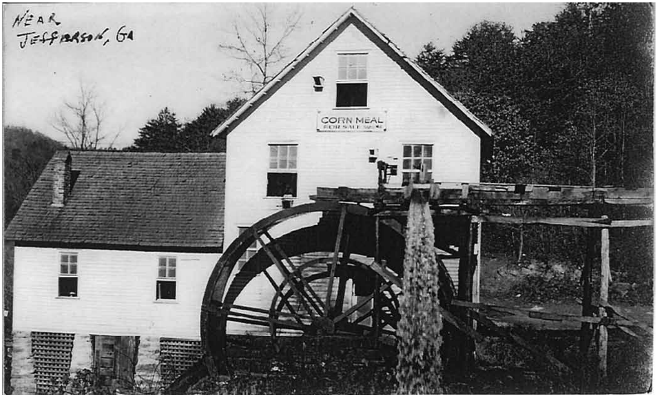
photograph of the Jefferson Roller Mill

The Jackson County Historical Society will meet at the Civic Center in Jefferson on August, 2011 at 2:30 p.m.