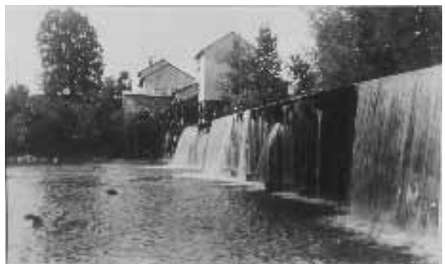
Johnson Mill in Galilee community