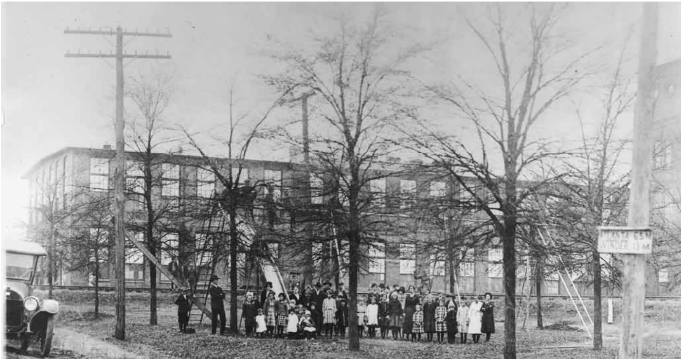
Children's playground at the Jefferson Mills, circa 1920

Back newsletter issues can be obtained for $3.00 each plus postage. Some of the past newsletters can be viewed online at: rootsweb.com/~gajackso/