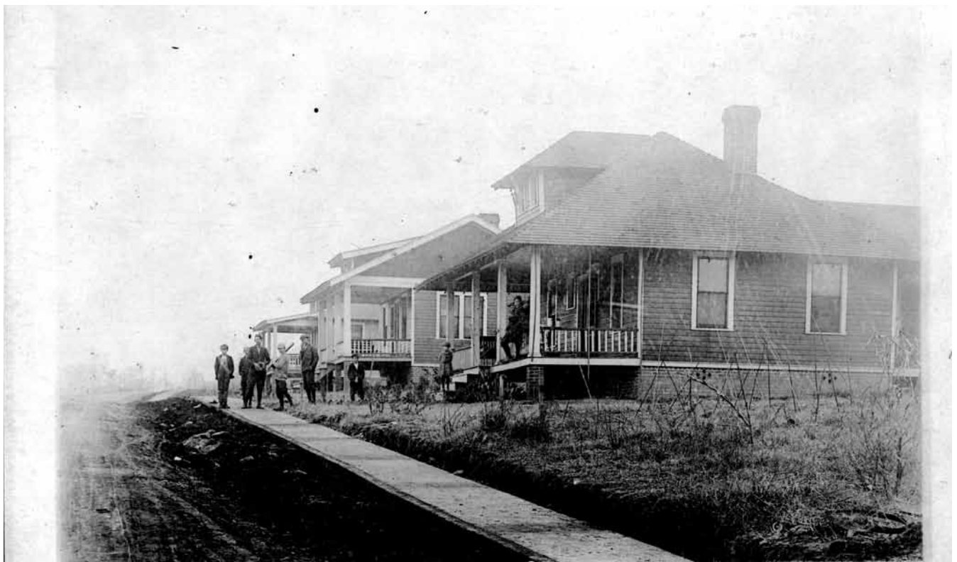
Cobb Street, Jefferson Mill Village circa 1927