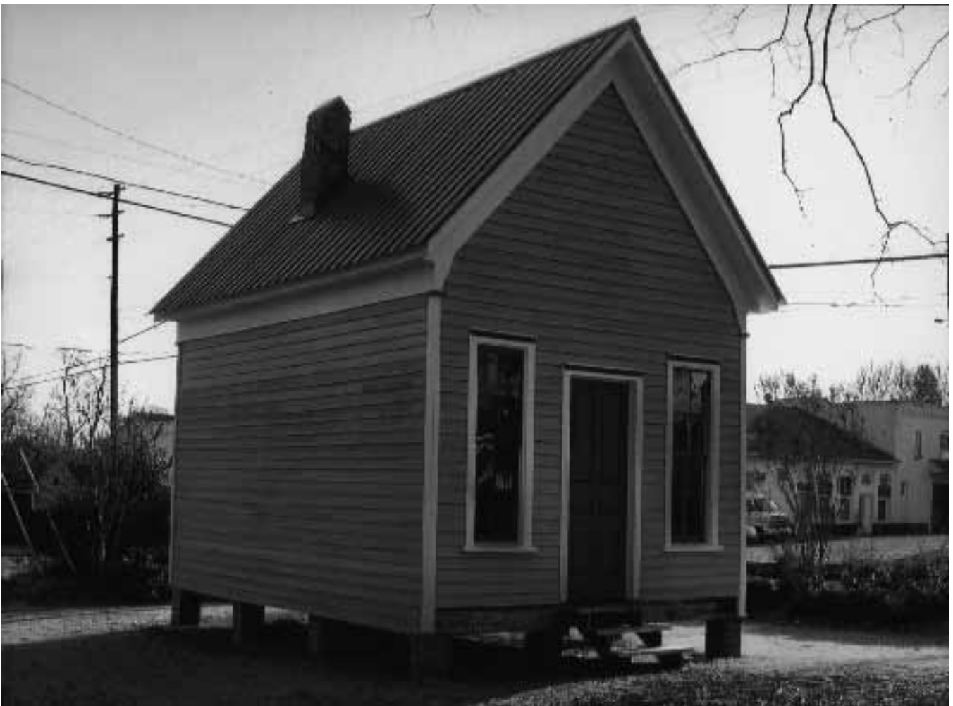
Darby Building, built circa 1880

The Jackson County Historical Society will meet at the Historical Hoschton Train Depot on Sunday, February 20, 2011 at 2:30 p.m. A program will be presented by the Hoschton Historic Commission on the moving and restoration of the Darby Building. The Historic Preservation committee of the Hoschton Women's Civic Club will present information on the preservation of the Historic Train Depot. There will be visual aides and historic memorabilia.