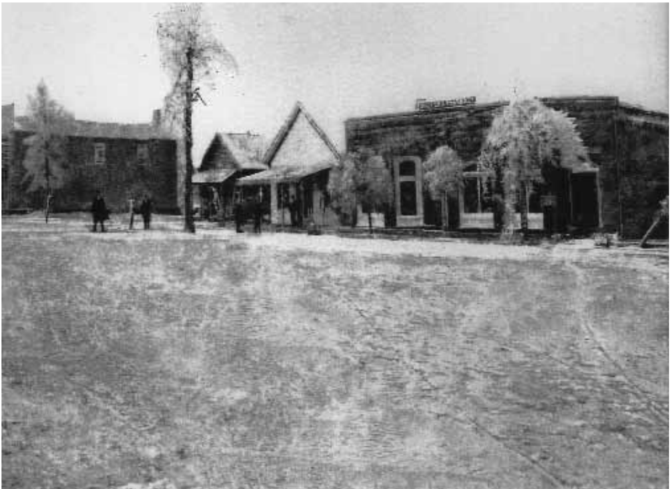
Hoschton Town Square, circa late 1880's; The Darby Building is the second building on the left.