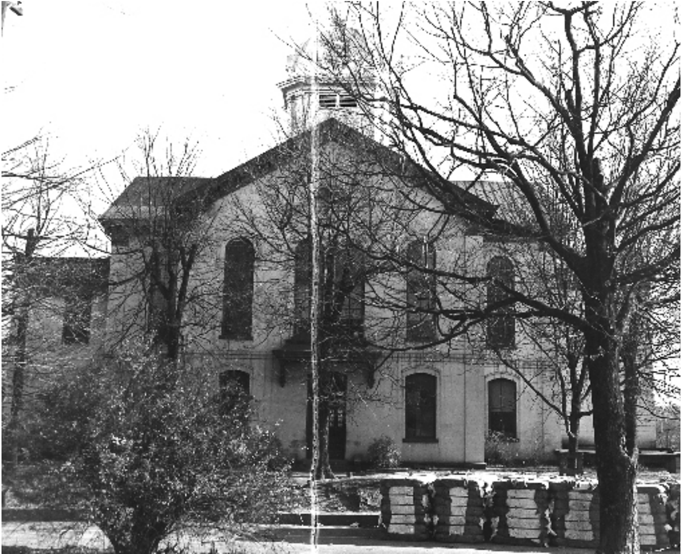
The Jackson County Courthouse circa 1900